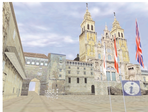
Screenshot of the Santiago 2000 virtual city, the first NAVE application.