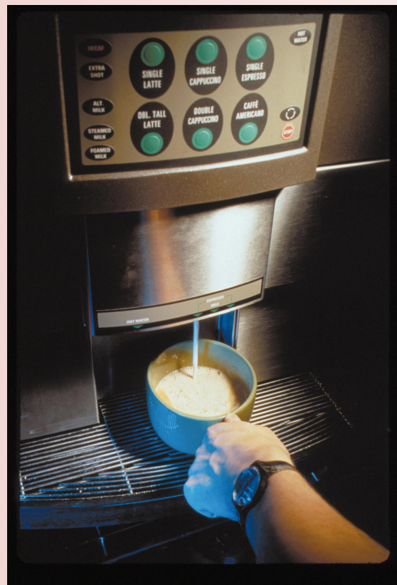
A Mr Java serves up your preferred mix of coffee and news.